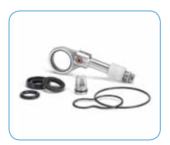
Repair Parts76227Inlet Valve Kit76218Discharge Valve Kit76219Seal & O-Ring Kit76555Plunger Rod Assy

Our global mission is to exceed every customer's expectation for quality, reliability, product availability, and technical support. This mission is the foundation of our company's ongoing success. Cat Pumps' products provide a low-life cycle cost, giving you exceptional value over the life of the system.