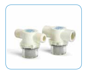
Strainer 7203.3 1/4" NPTM 7204.4 1/4" NPTF