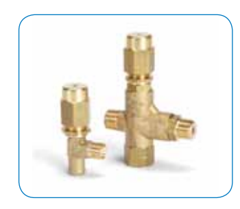
Pressure Controls7085 Regulator7580 Unloader